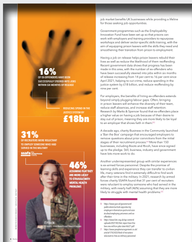
SBFM's Evolve Programme white paper