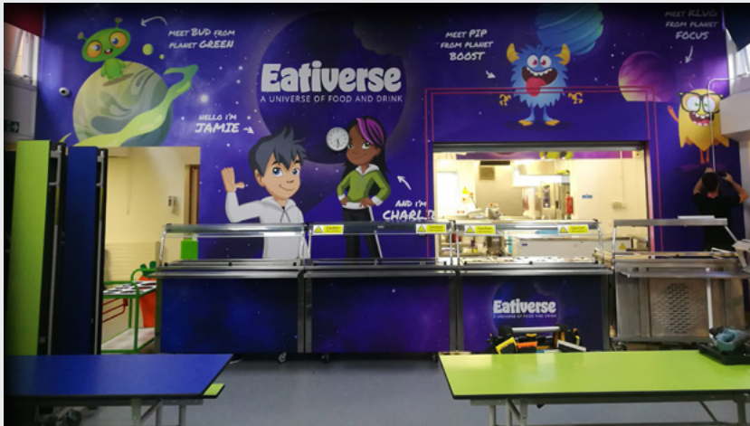
Eativerse project designed to educate children about healthy eating habits